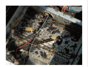
Wiring that has been saturated with oil, hydraulic fluid, or other lubricants